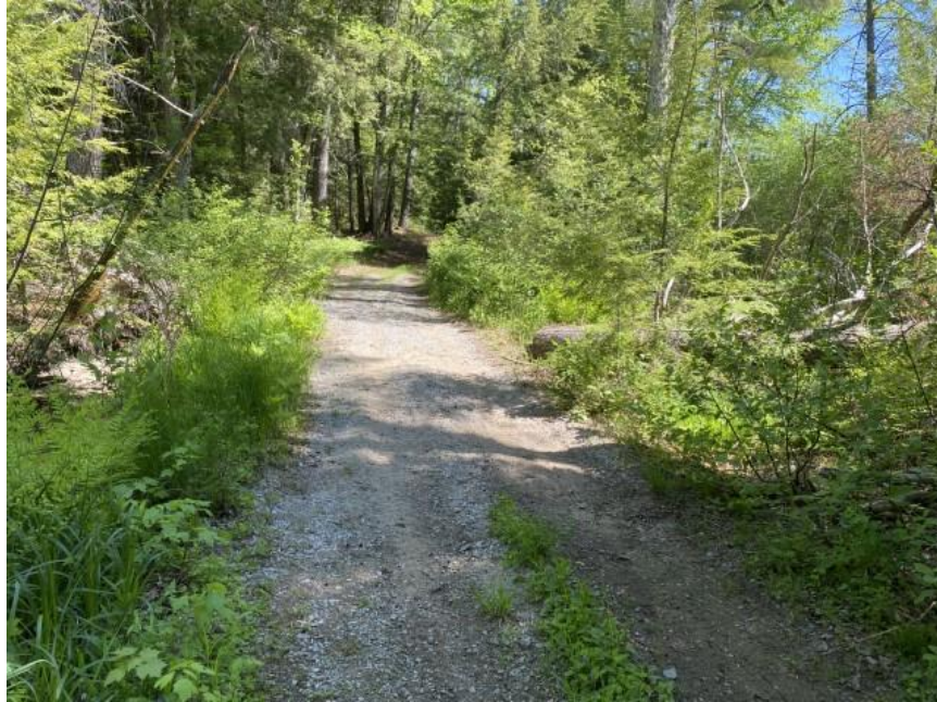
Above: access road over Deer Meadow Brook where three culverts will need replacing/removal

Other impacts are anticipated for rare & endangered species since there are NHB ‘hits’ for both Blanding’s turtles and black racers in the vicinity of the project site. According to Dom LeBel, much of the northern part of the north lot where there are several vernal pools and an extensive wetland system adjacent will be avoided in terms of panel construction. Although not required by the state or the town, adequate buffers to all wetlands will also be a part of the design plan. Best Management Practices (BMPs) will also be incorporated into the design for turtle passage underneath the perimeter fence that will provide the necessary security for the panel arrays.