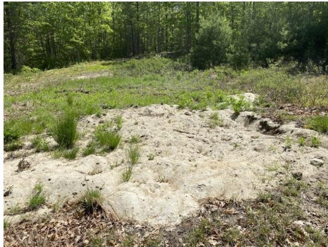
At right: black racer habitat in old sand pit

In terms of the black racer, the one known site where habitat exists for the snake was reviewed in the field. The 1-2 acre patch lies just south of the Deer Brook wetland complex and just northeast of the proposed crossing area. After surveying the habitat it was discussed and suggested that this area be kept out of the construction of any panels and be included in the protection zone for the nearby wetland.